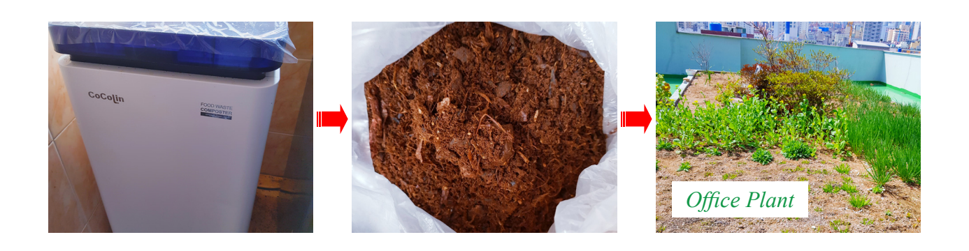
• To reduce the consumption of fresh raw materials : Separate trash for Recycling

• To reduce disposable waste : Use a personal tumbler and tableware