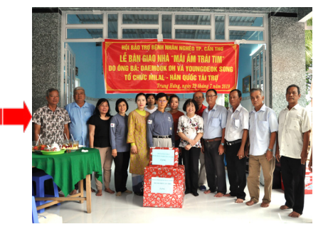
No.21 House building