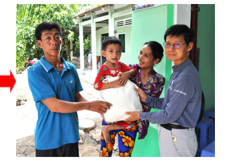
No.22 House building